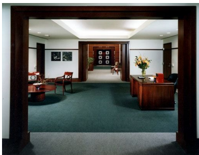
Supreme Court, IL (above) Original Building - Chicago, IL California Pizza Kitchen (left) Oak Brook, Illinois - various US locations