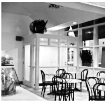
Bittersweet Bakery Chicago, Illinois