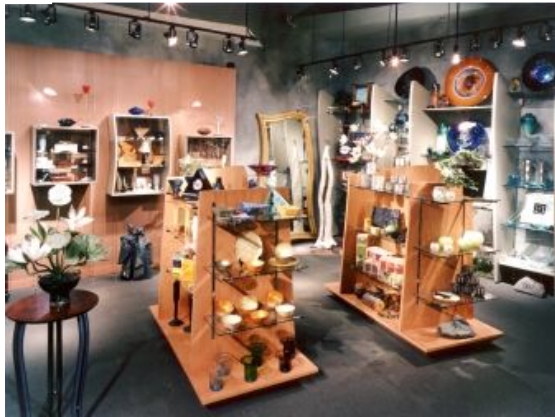
HoyPoloi Gifts Walt Disney World, FL