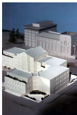
UCB Student Services Ctr. Berkeley, Calif.