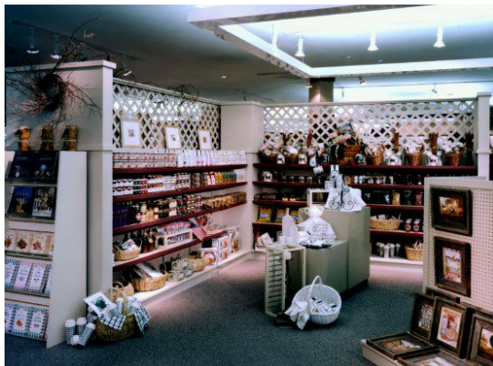
Country Sampler Appleton, WI