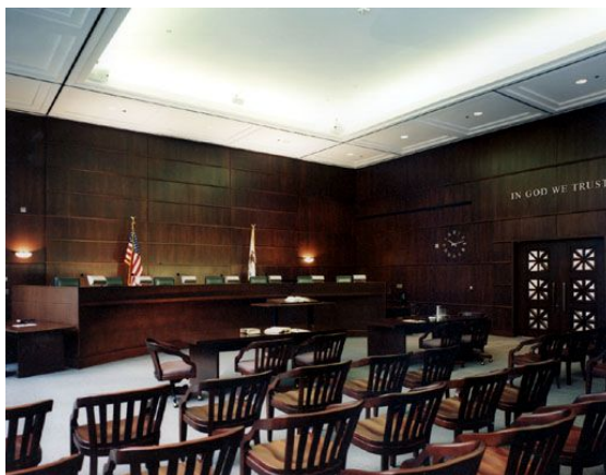
Supreme Court of IL State of Illinois Building Chicago, Illinois