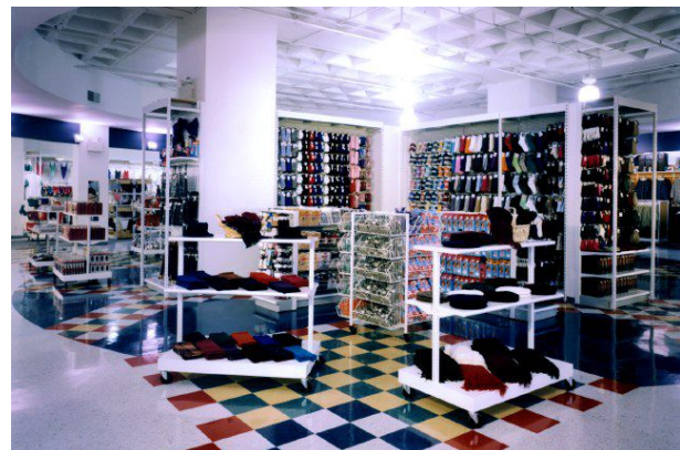
US Factory Outlet Discount Retailer Springfield, MA